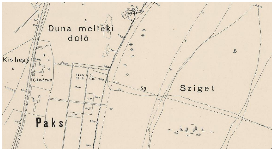
Figure 1: Part of a map sheet

The drawings on the sheets are very simple; they consist of curves and labels in black only (Figure 1).