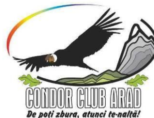
CONDOR TOURIST CLUB ARAD