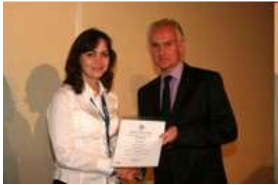
Travel award winners