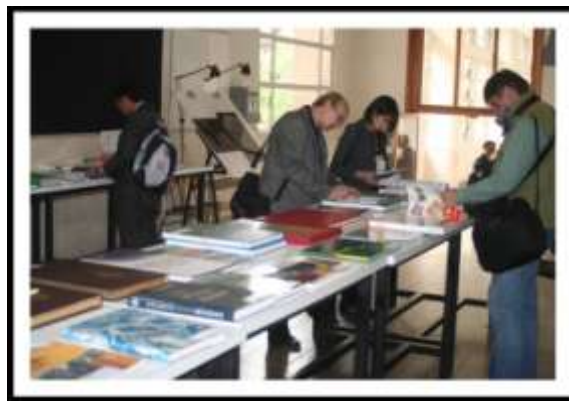
Examples of maps in the International Map Exhibition