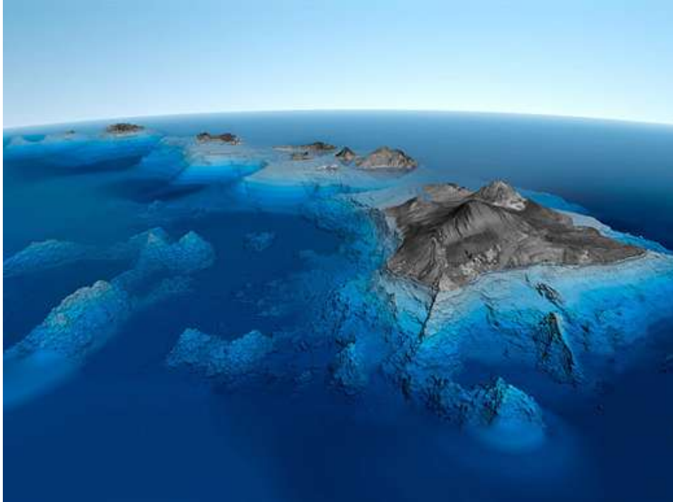
Hawaii Volcanoes National Park AFP/Getty

UNESCO and the German Aerospace Centre exhibition presenting large sized satellite pictures of the world (below are two examples. AFP/Getty