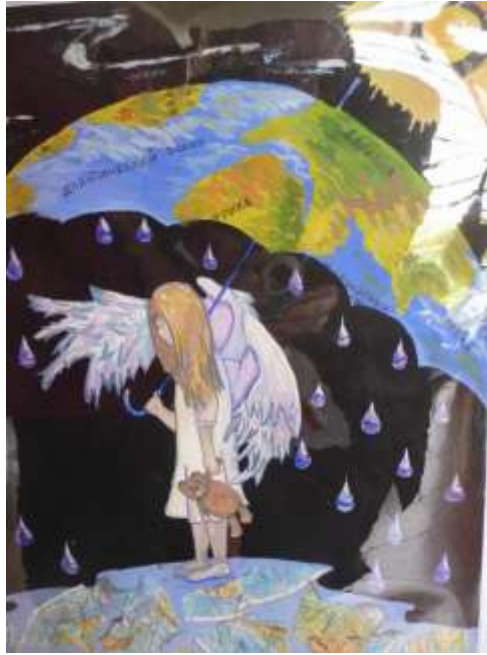
One of the winners