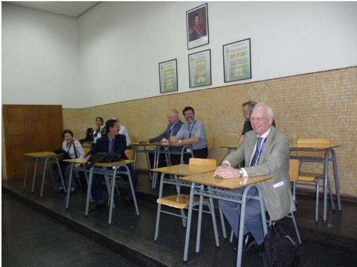
The not so official photograph