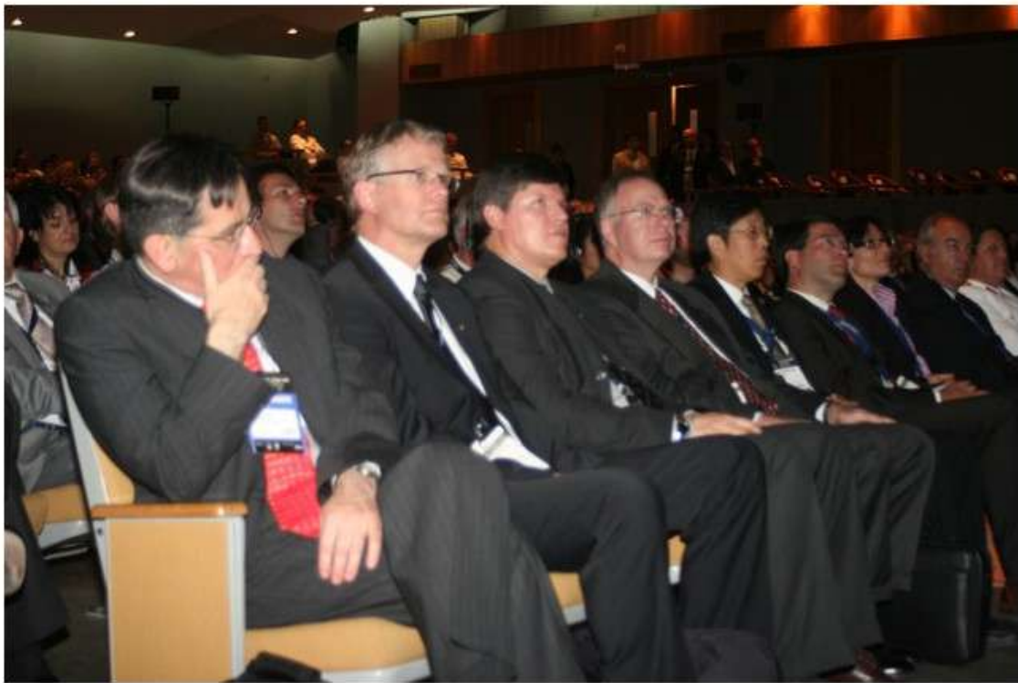
Members of the ICA Executive at the Conference