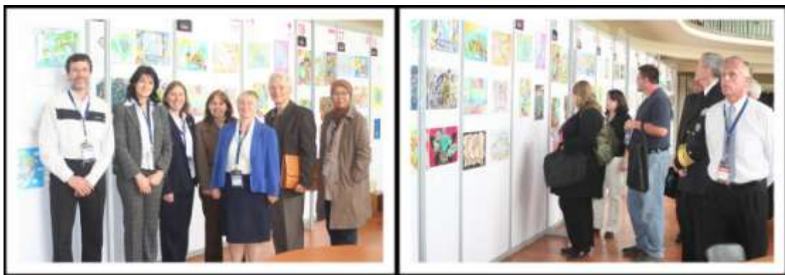
International jury members

The jury was composed of representatives from Bulgaria, Hungary, Argentina, Indonesia, Canada, Brazil, Spain and Chile.