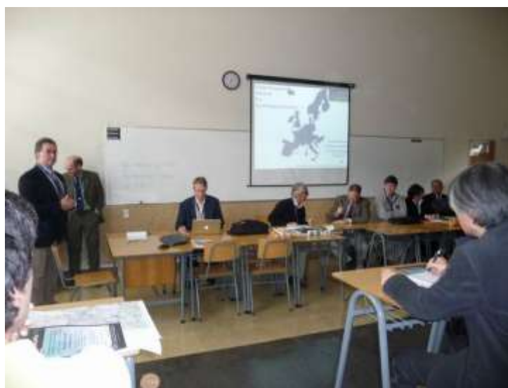
Executive at meeting with Commission chairs