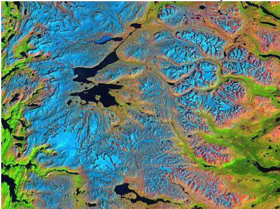
The Laponian Area in Sweden