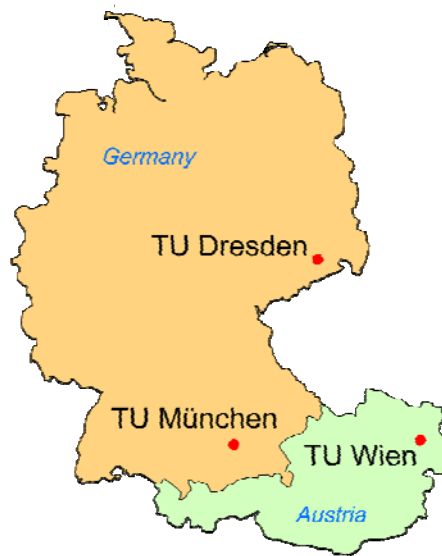
Figure 2. Participating universities in the international master Cartography & Geoinformatics

Target students are high-qualified students from all over the world especially from Asia and Europe, holding a bachelor or diploma degree in cartography or related subjects. The Master program will accept high-quality and top-level educated students to prepare them for current workforce demands while giving them a life-long career path. One important aspect is an intensive and individual supervision of the students.