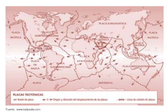
Figure 3. Map superficial distribution of the Earth's tectonic plates

Example of Students' worksheet. The Task: Students wrote a short text about the eruption of Chaitén volcano, in May of 2008, where it is described the evacuation of the city of Chaitén and made references of the extension of the affected region. Besides, they analyzed a map that showed the superficial distribution of the Earth's tectonic plates. Then, they were asked to link the location of Chile with the existence of this geographical phenomenon and to determine others place where it could occur a similar phenomenon.