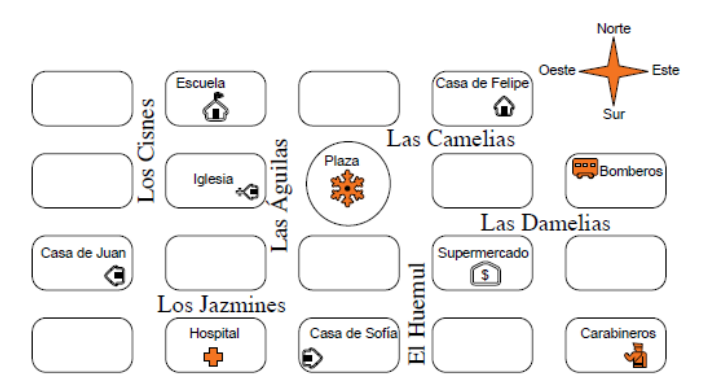
Figure 1. City map: different buildings as public and private places.

Examples of students' worksheet . The task: The students received a city map showing different buildings, as well as public and private places (people's home). The map included a compass card. Afterwards they had to for answer four questions. In two questions they had to locate different elements in the map using cardinal points and relative points of reference. The third question described a route, and then students had to explain where the route led to. Finally, in the fourth question, students had to give instructions to move from one place to another.