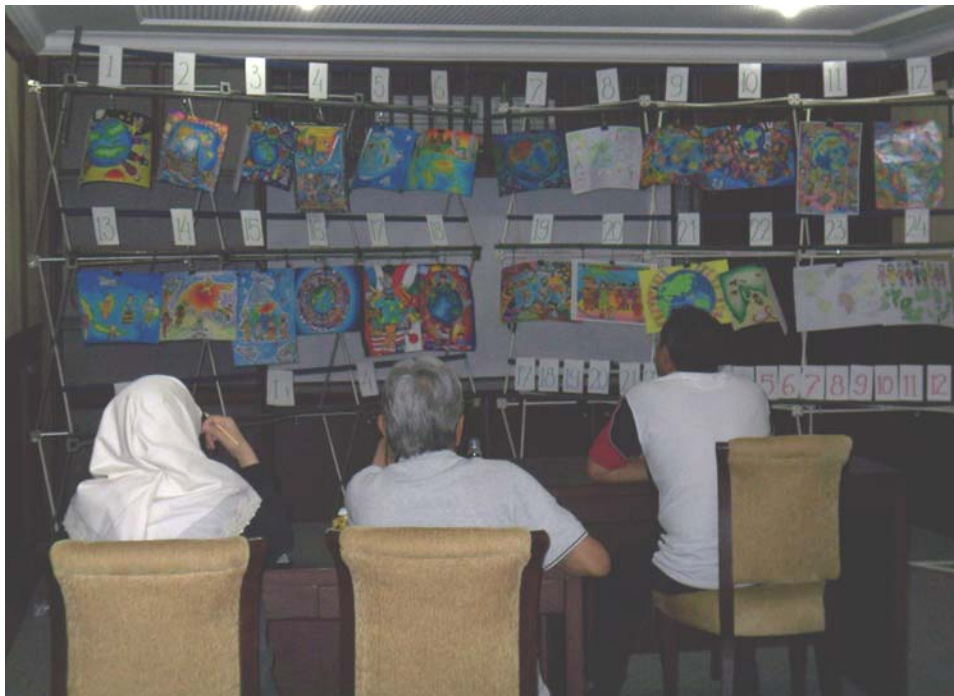
Figure 4. Judgment by board of internal juries

During the selection process by board of national juries, it is important for the juries to be able to see all drawings at once. Therefore, all drawings from each group were put on the floor with the drawing side up. The juries then looked around and eliminated the drawings by turning the drawing side down. It was not so hard in the beginning, but as the drawings got fewer, the juries would discuss to determine the best 15 drawings.