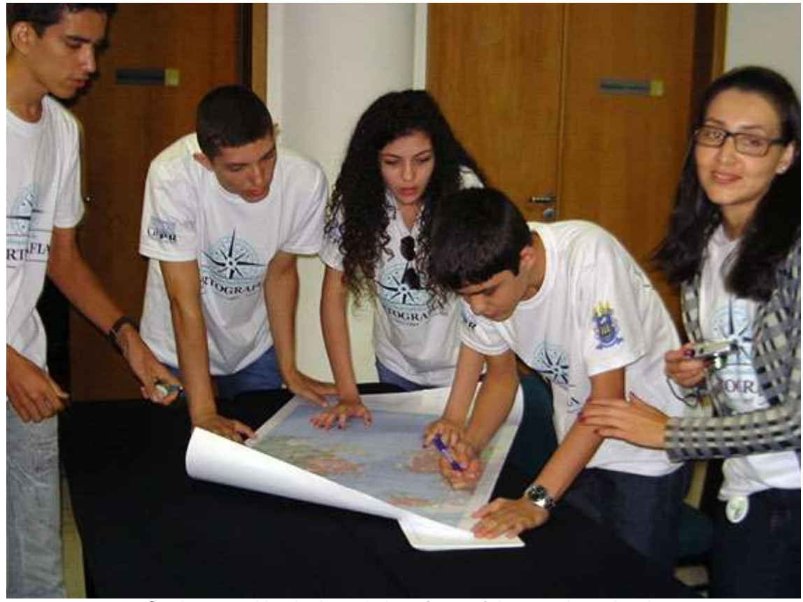
Students working in the solution of one of the map-based tasks