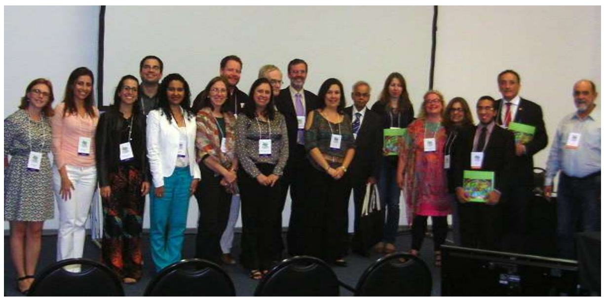
Participants in the meeting of the Commission on Cartography and Children

The commission had its meeting in the afternoon of the 25<sup>th</sup> of August, after finishing the activities of the second day of the conference. The topics presented by the Commission Chair were: