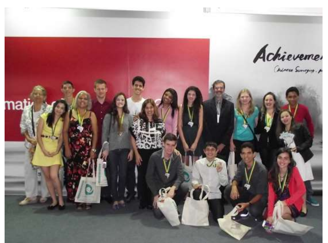
Photo taken after the announcement of final results of the 1st Brazilian Cartographic Olympiad during the opening ceremony of ICC 2015

Some photos taken in the Barbara Petchenik Exhibition during ICC2015: