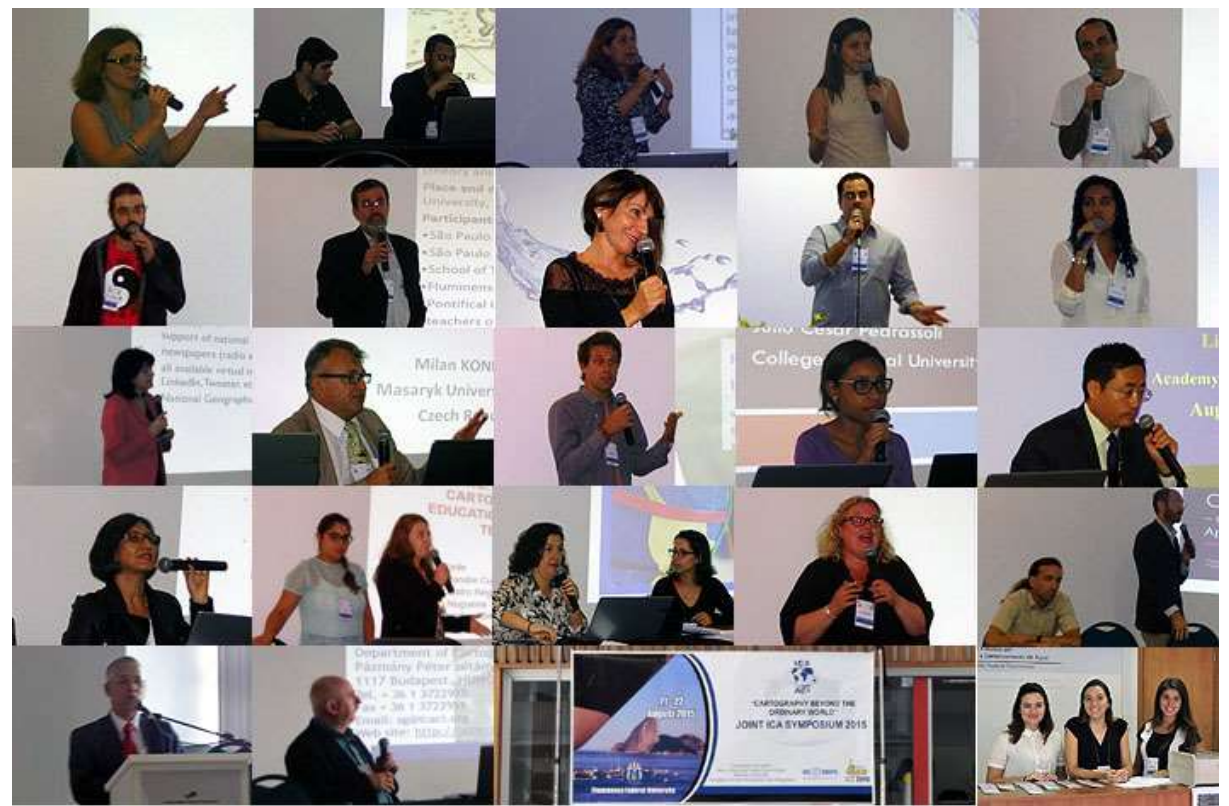
Presenters in the Joint ICA Symposium 2015 in Niterói

Resuming, the joint symposium was a unique opportunity for the members of the four Commissions (and participants in general) to share and learn about the results of latest research projects developed during the last two years. More detailed information about the event (including more photos and the Proceedings in pdf format) can be found on the website of the symposium: http://niteroi2015.elte.hu/.