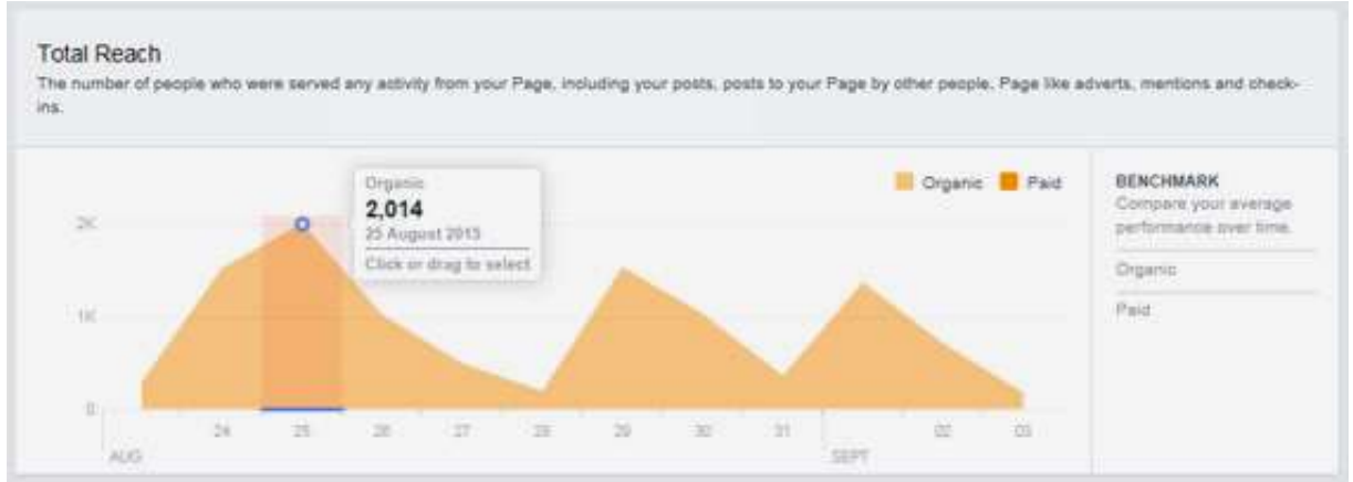
Chart showing the highest number of persons reached during ICC 2015

The three "peaks" in the chart are related to news on the Barbara Petchenik Competition: the most visited post was the collection of photos taken in the Barbara Petchenik Exhibition, presenting the folding screens of each participating country (1 374 reaches and 3 965 clicks). The second one was the post of the table with the results of the competition (1150 interested people) and the third one was presentation in pdf format with more details about the winners of the competition (564 people reached and 1 200 clicks on the post). The day when the most people (2 014 persons) visited the profile was 25 August, when three posts related to the exhibition were published (photos about the organization of the exhibition, of the opening ceremony and of folding screens with the drawings by countries).