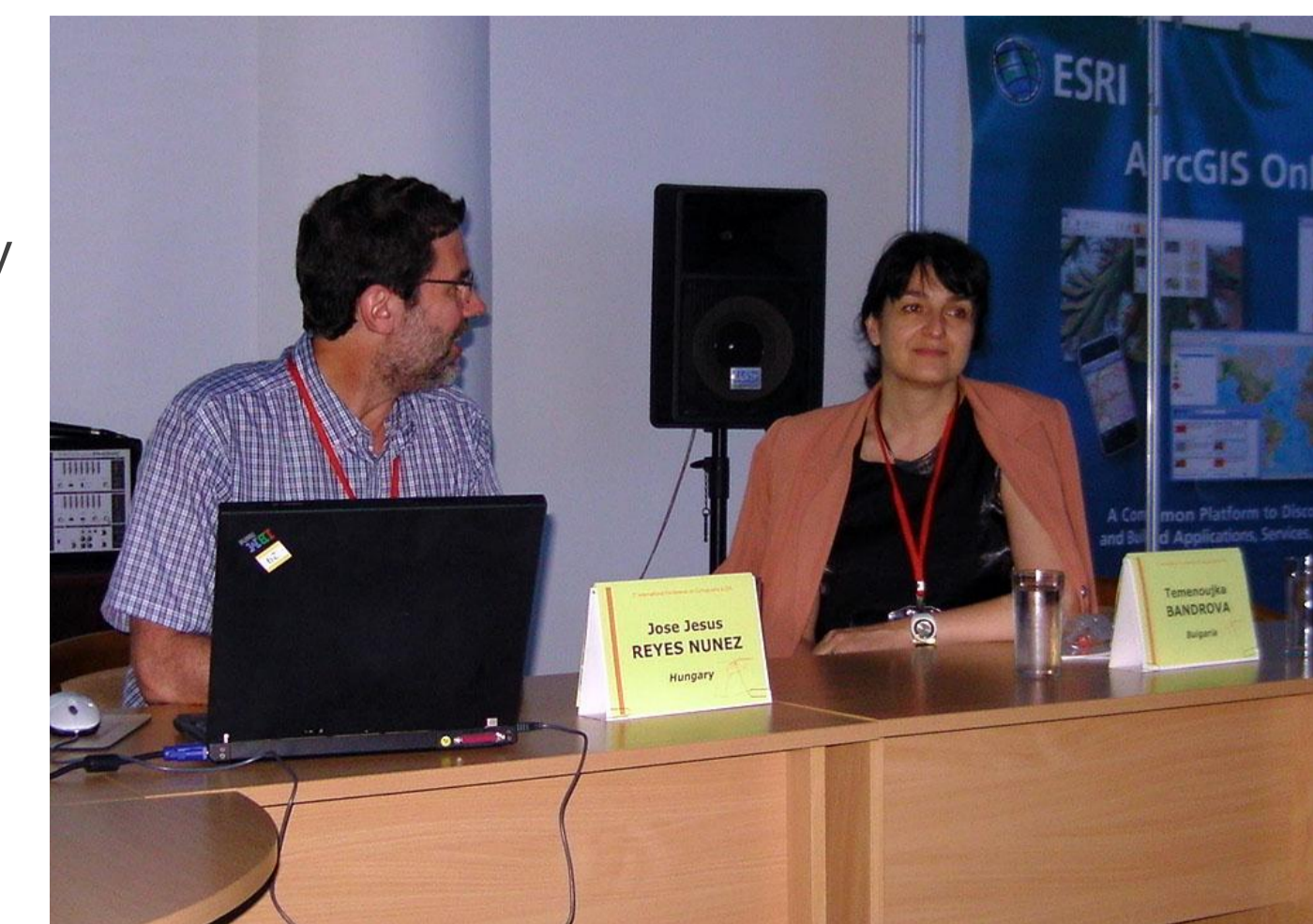
Commission Meeting during the 3rd Conference on Cartography and GIS (Nessebar, Bulgaria, 2010)