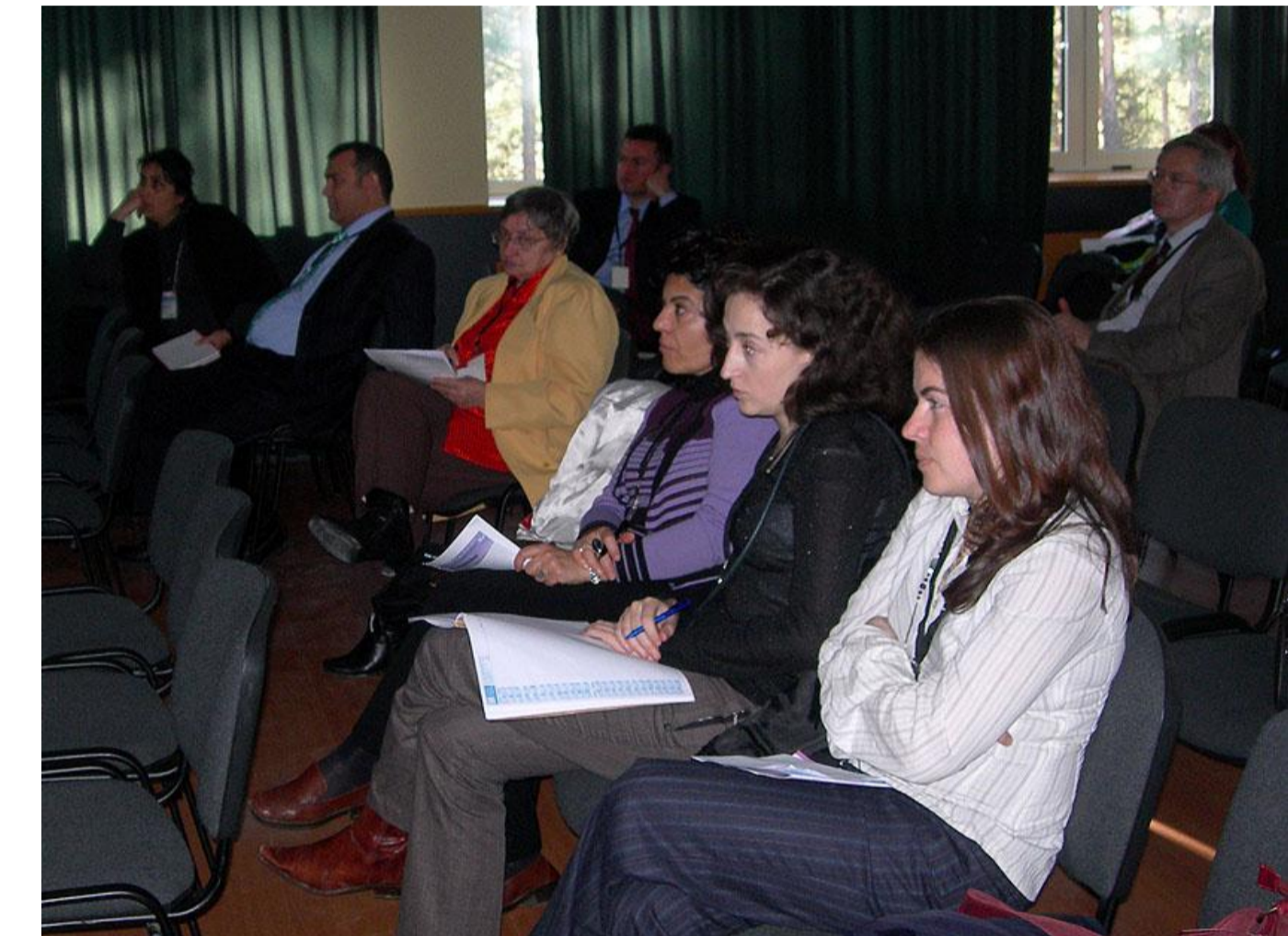
Commission Meeting during the 2nd Conference on Cartography and GIS (Borovets, Bulgaria, 2008)

Before the ICC 2011 the Commission collaborated in the organization of a Joint ICA Symposium of four Commissions and a Working Group (Cartography and Children, Education and Training, Maps and Internet, Planetary Cartography and Cartography on EW-CM) at the University of Orleans (30 June - 1 July, 2011). A selection of papers presented in this event (under the title of „Maps for the future: Children, Education and Internet”) will be published by Springer Verlag next November.