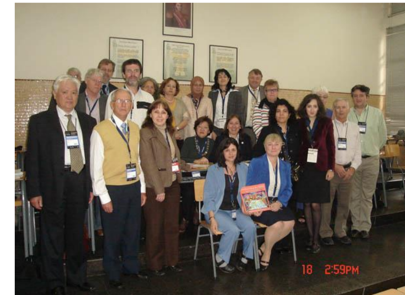
Commission Meeting during ICC 2009 (Santiago de Chile)