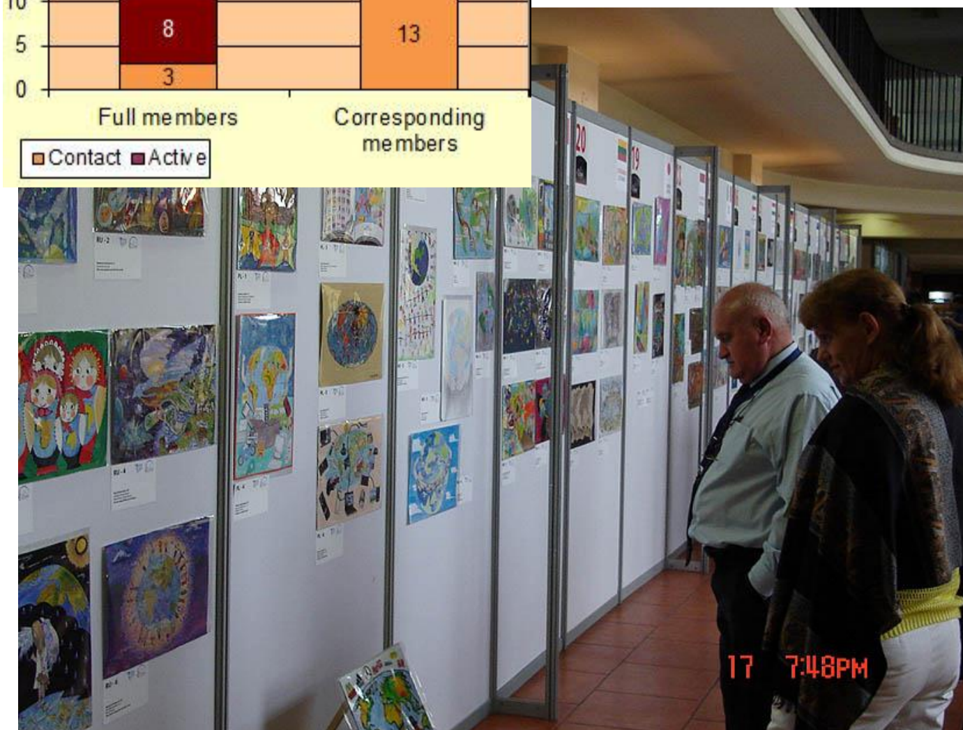
Barbara Petchenik Exhibition 2009 (Santiago de Chile)