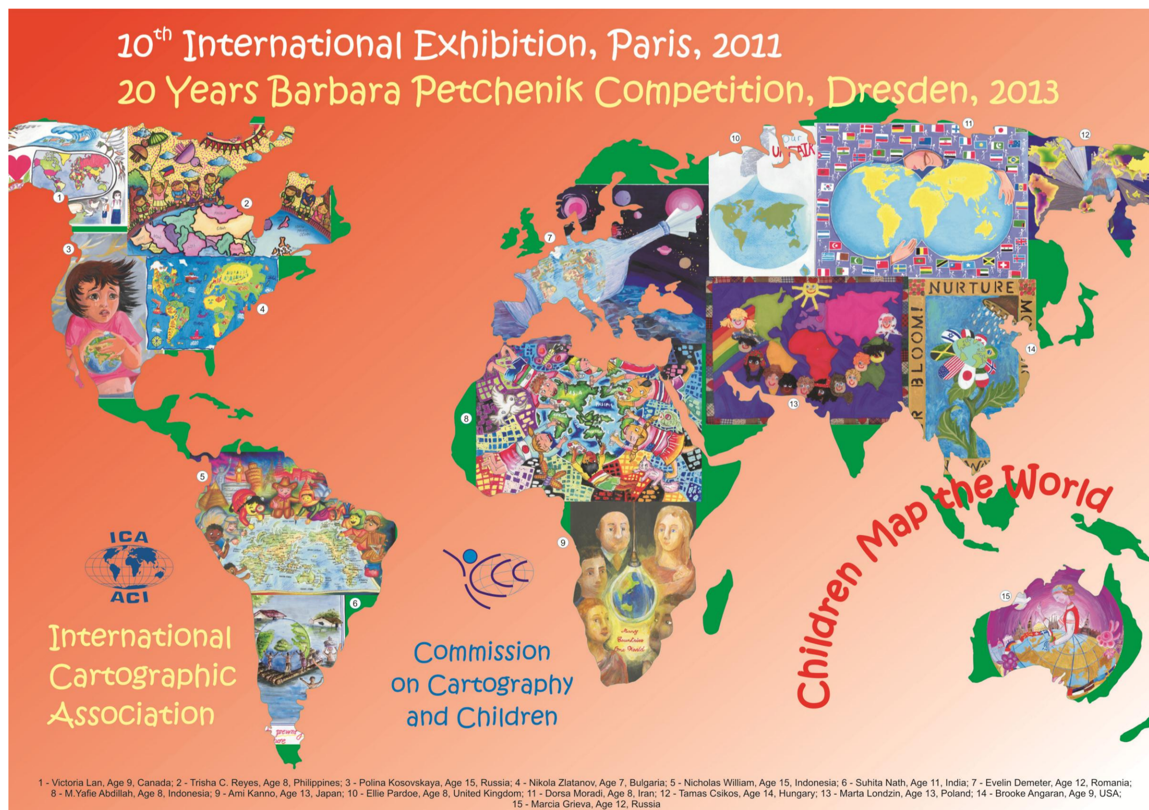
Poster commemorating the 10th Barbara Petchenik Exhibition (Paris, 2011) and the 20th Anniversary of the Competition (Dresden, 2013)

Membership - 55 members from 25 countries, including Brazil (7), Argentina (5), Greece (5), Spain (4)