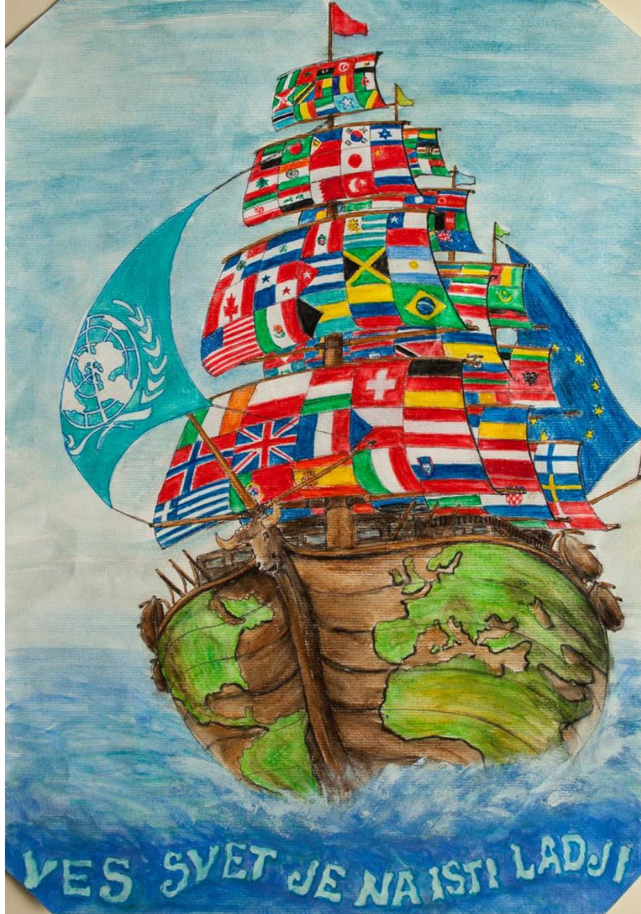
Andraž Umek (8) Slomška Vrhnika (Slovenia)